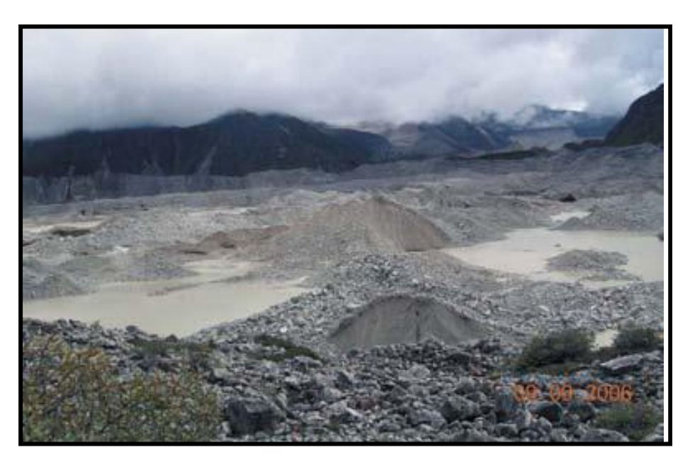
Fig. 3 : Supraglacial lakes formed on Thorthormi glacier, Bhutan

Supraglacial lakes develop over the surface of a glacier (Fig-3). These lakes may develop anywhere on the glacier, and the lake's surface area is usually less than half the diameter of the Valley glacier. Shifting, merging, and draining the lakes are the characteristics of the Supraglacial lakes. The merging of lakes results in expanding the lake area and storing a massive volume of water with high potential energy. The tendency of a glacial lake towards merging and expanding indicates the danger level of the GLOF. Over time, the supraglacial lakes, formed on the glacier's surface, join and take the shape of an end moraine dam glacial lake.