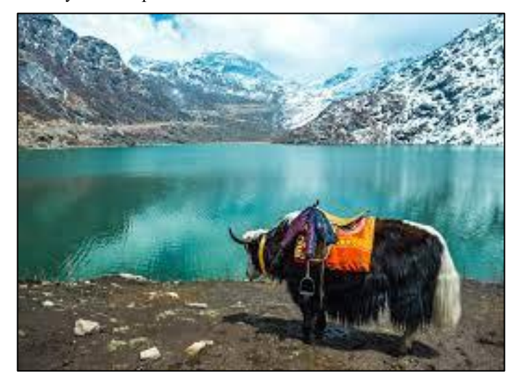
Fig. 1 : Trough Valley Glacial lake (Changu Lake Sikkim)

Glacial Erosion lakes are formed in a depression left after glacier retreat. They may be Cirque-type or trough Valleytype lakes and are generally considered stable lakes (Fig-1 &2). These Erosion lakes might be isolated and far from the present glaciated area. These glacial lakes occupy the lowlands or emptying cirques eroded by ancient glaciers. These lakes could be dangerous if they are near potential snow avalanche sites.