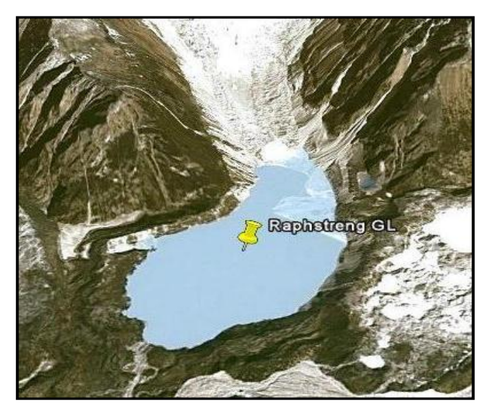
Fig. 4 : Moraine dammed Lake Raphstreng Tso, Bhutan, in contact with the glacier snout

Many supraglacial ponds may slowly grow to create an enormous moraine-dammed lake. These lakes are formed not only due to snowmelt but also from the rainfall contribution from its catchment. With the increase in temperatures and the associated melting of the glacier, the lake widens and deepens to form a substantial glacial lake with bedrock and moraines.