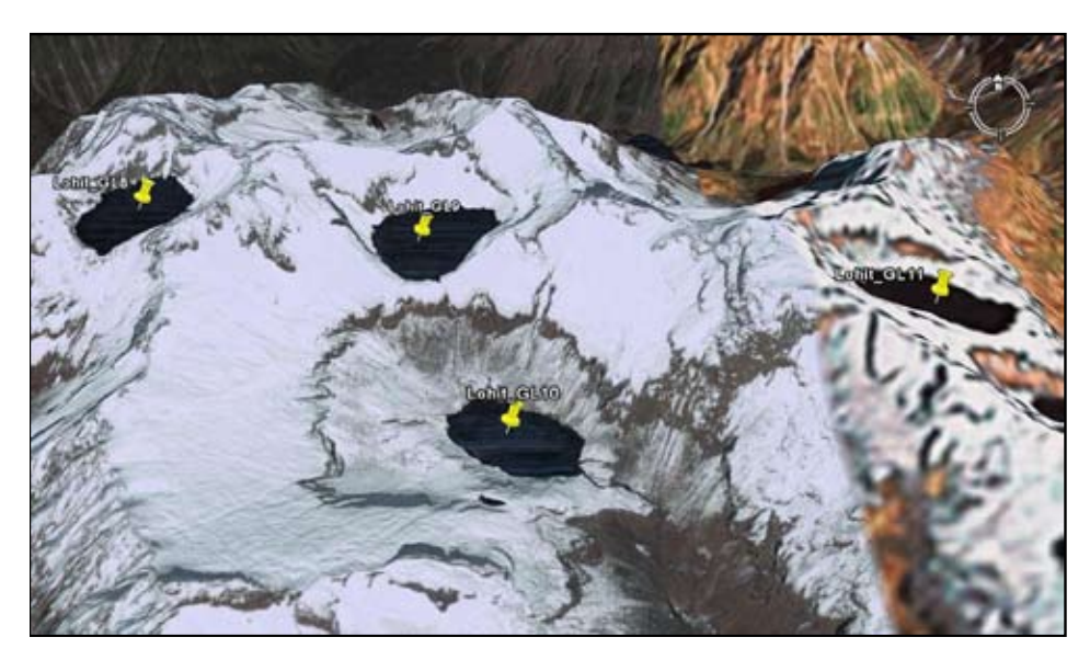
Fig. 2 : Cirque lakes in the Lohit basin