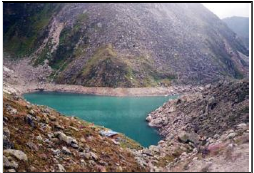
Fig. 5: Blocking lake (Satopanth Tal)

Blocking lakes are formed through glaciers and other factors, including the main glacier blocking the branch valley, the glacier branch blocking the central valley, and the lakes through snow avalanche, collapse, and debris flow blockade. (Fig. 5)