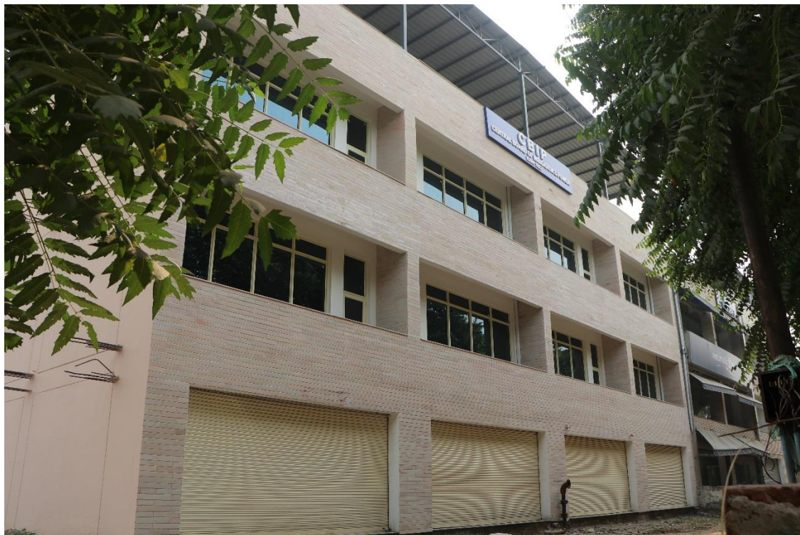
Back side view