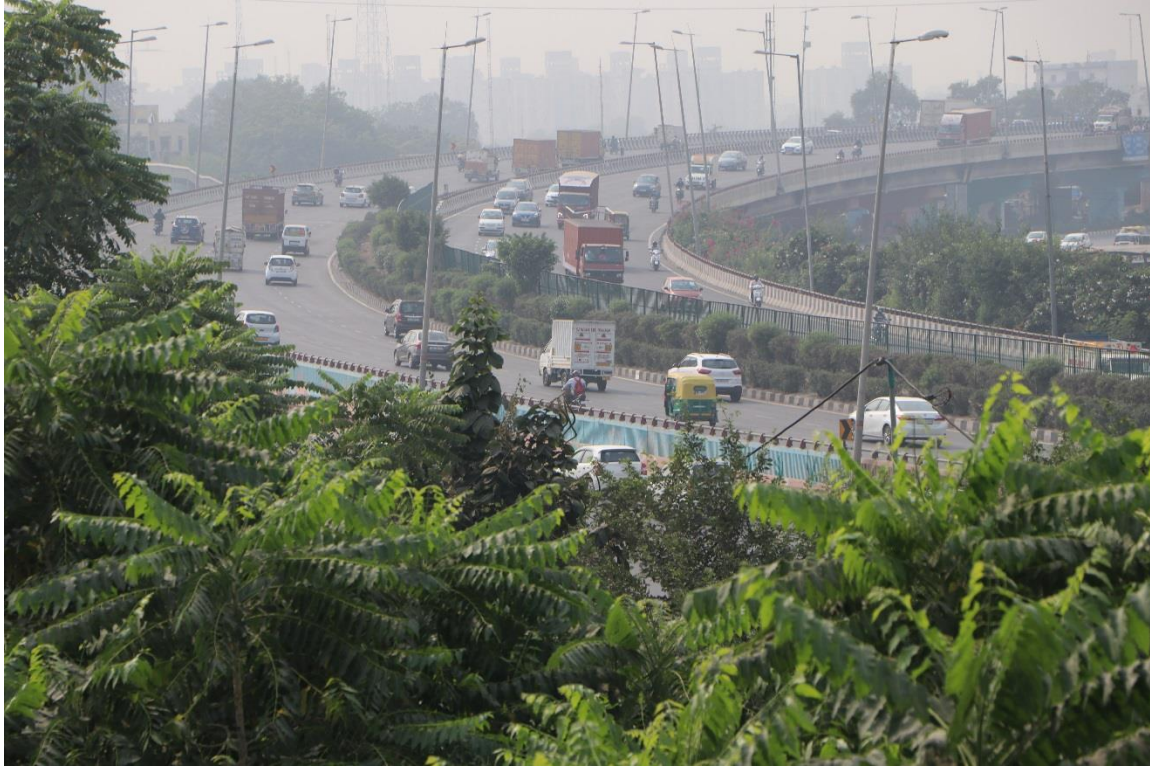
Located near NH 8