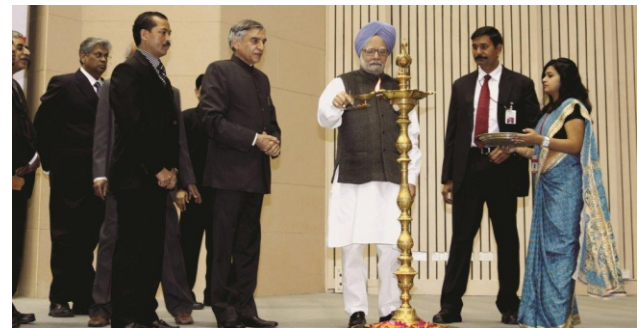
Hon'ble Prime Minister Dr. Manmohan Singh inaugurating the 5th Asian Regional Conference on 10 th December 2009 at Vigyan Bhawan, New Delhi managed by Central Board of Irrigation & Power (CBIP).