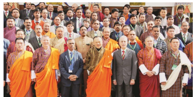
International Conference on Accelerated Development of Hydropower in Bhutan – Opportunities and Challenges. Hon'ble Prime Minister (First Row in the centre).