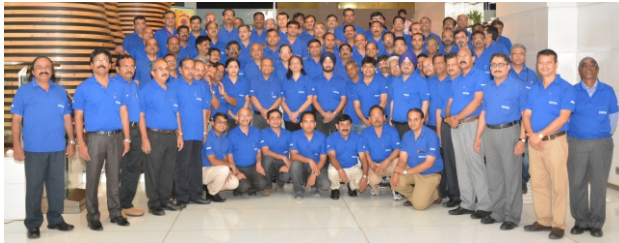
Group photo of some of the 106 participants from 35 companies who participated in the program and have acquired CIPM credential.