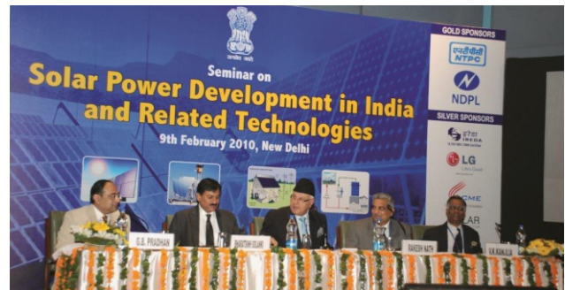
Dr. Farooq Abdullah, Hon'ble Union Minister for New and Renewable Energy, was inaugurated the seminar on "Solar Power Development in India and Related technologies", 9 th February 2010, New Delhi.