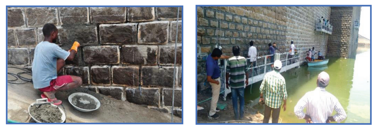
cube. The product shall have controlled expansion characteristics of 1 to 4% when tested as per ASTMC 827 – 1987. Figure 6 : Application of cavity Filling- During Execution

Providing and filling the deeper cavities of the RR masonry which are beyond 5 cm and up to 18 cm using non-shrink, cementitious micro concrete mixed with water at ratio 0.16 to fill the gaps where normal access is restricted and to achieve proper compatibility and placement without vibration. The micro concrete shall contain no-chloride admixture and provides minimum compressive strength of 40 N/mm<sup>2</sup> in 7 days & 50 N/mm<sup>2</sup> in 28 days when tested in 70.7mm