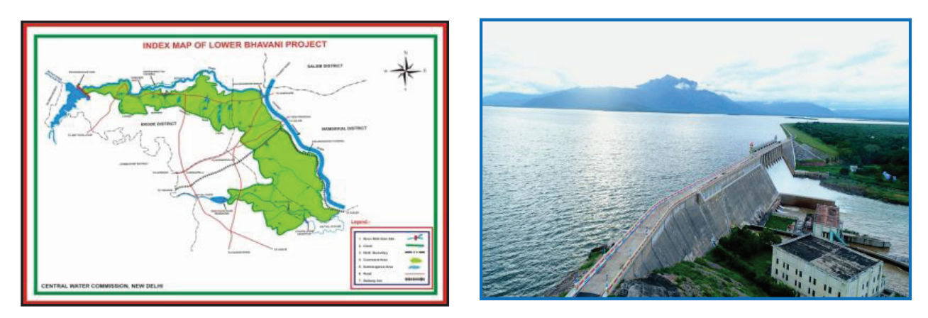
monitoring the seepages.