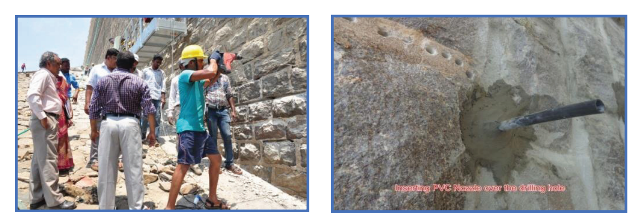
material shall give minimum compressive strength of 35 N/mm<sup>2</sup> in 28 days when tested in 10cm cube. On completion