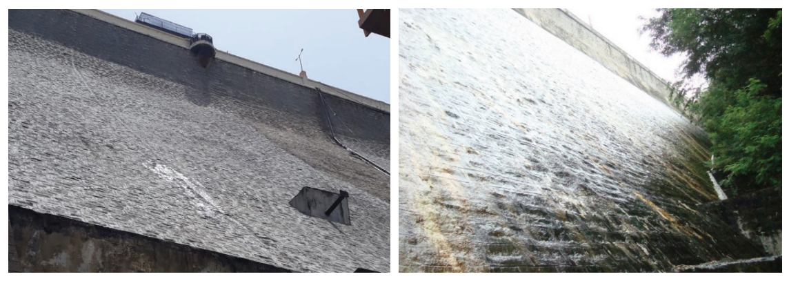
Figure 6 : Downstream side before and after geomembrane installation.