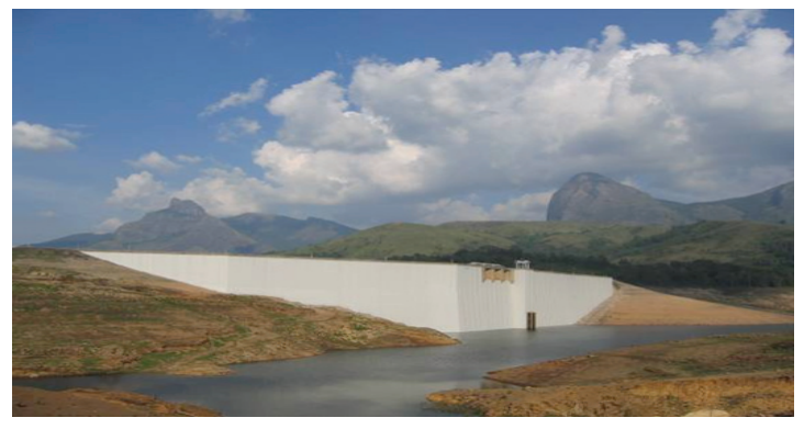
Figure 4 : Kadamparai dam after installation of the geomembrane system