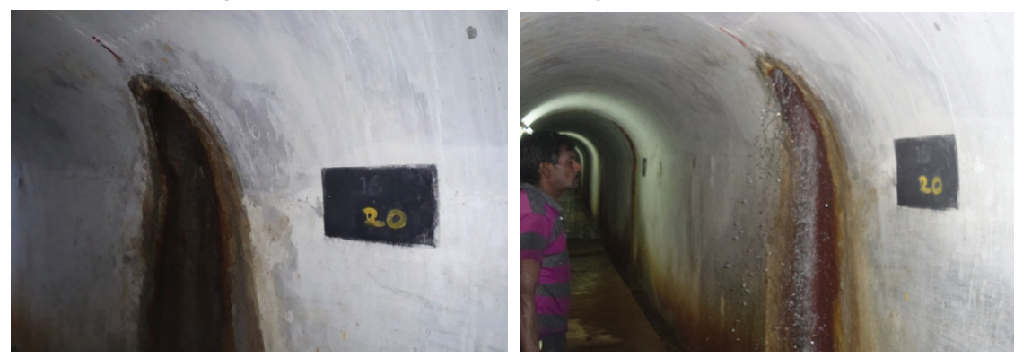
Figure 7 : Vertical shaft leakage before and after geomembrane installation.

The results achieved is yet another proof of effective and professional design of geomembrane waterproofing system on large dams. A dam which was leaking at a rate of > 6,000 litres/minute is now reduced to just < 2 litres/minute on the left and spillway section.