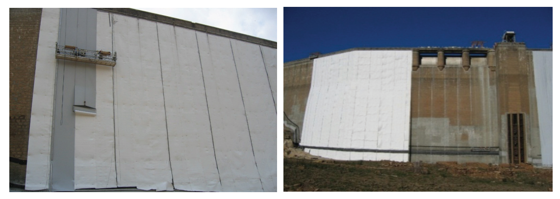
Figure 1 : Installation of anti-puncture geotextile and of waterproofing geocomposite.

The major elements included the anti-puncture geotextile layer of 2000 g/m^2 , installed on the entire upstream face of the dam to reduce risk of puncture by the very aggressive surface of the stone masonry blocks. The nonwoven needle-punched geotextile made of pure polyester fibre was anchored to the face (Figure 1 at left).