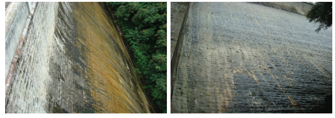
Figure 5 : Heavy seepage on left flank.

Earlier attempts by the maintenance wing of TANGEDCO (Generation Team) consisted of racking/packing with cement mortar, racking/packing with chemical epoxy/mortar, grouting and joint chemical treatment. The attempts to control the seepage did not give a permanent solution and instead the leakage continued to rise every year. With the available data and observation, the water oozing out from the downstream side should be more than 5,000 l/minute(approximately) from the left and spillway blocks.