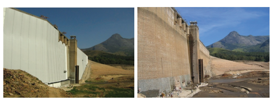
Figure 2 : Upstream face of the dam before and after geomembrane installation.

Carpi was awarded the India Power Award for the year 2008 for this project in recognition for "Excellence in Water & Energy Management"