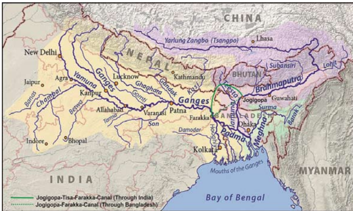
Fig. 2 : Brahmaputra-Ganga Link Through Bangladesh(Green-- ) and India ( Full line---)

In its revised proposal, Govt. of India decided to connect Jogigopa barrage with Tista and Ganga bypassing Manas and Sankosh rivers (Fig.2-Full line). The proposal envisaged the construction of three storage reservoirs (Subansiri, Dihang and Tipaimukh) in the eastern foothills of the Himalayas to supplement the dry season flow of the Brahmaputra at Jogigopa. The idea is to divert water from these storages to the Ganges in the months February to April when (according to India's estimate) water is abundant in the Brahmaputra and scarce in the Ganges basin due to late arrival of Monsoon in Ganga basin as compared to Brahmaputra basin. The Dihang and Subansiri reservoirs were estimated to lower the flood peak in Bangladesh by 1.3m while the Tipaimukh dam would reduce the flood in the Meghna basin in Bangladesh, especially in Dhaka [13,]. Owing to topographic factors, this link would involve a lift of 60 meter and require 7,500 MW of power [14]. However, it is exclusively within Indian territory and passes through the 32 km narrow belt (Known as Chicken Neck) separating India from Nepal and Bangladesh as shown in Fig. 2.